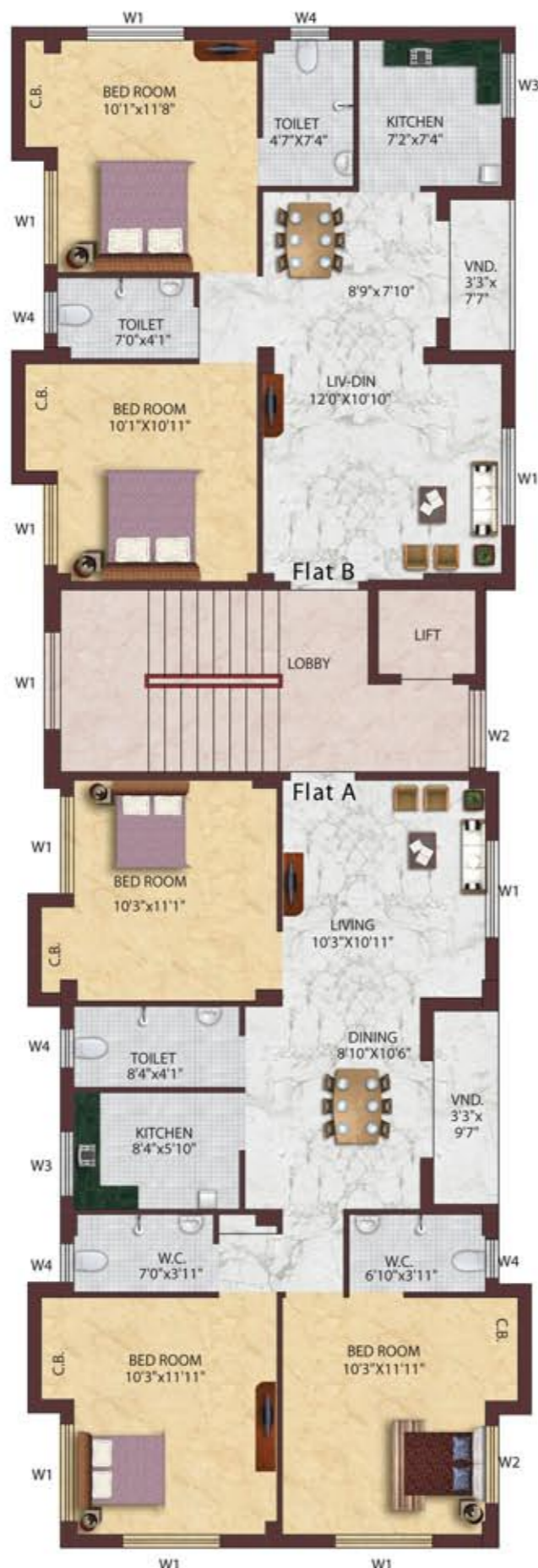
BLOCK B TYPICAL 1ST TO 3RD FLOOR PLAN