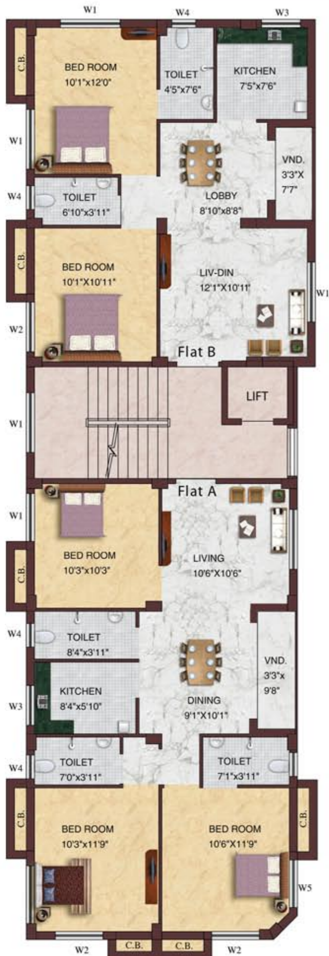
BLOCK A TYPICAL 1ST TO 3RD FLOOR PLAN